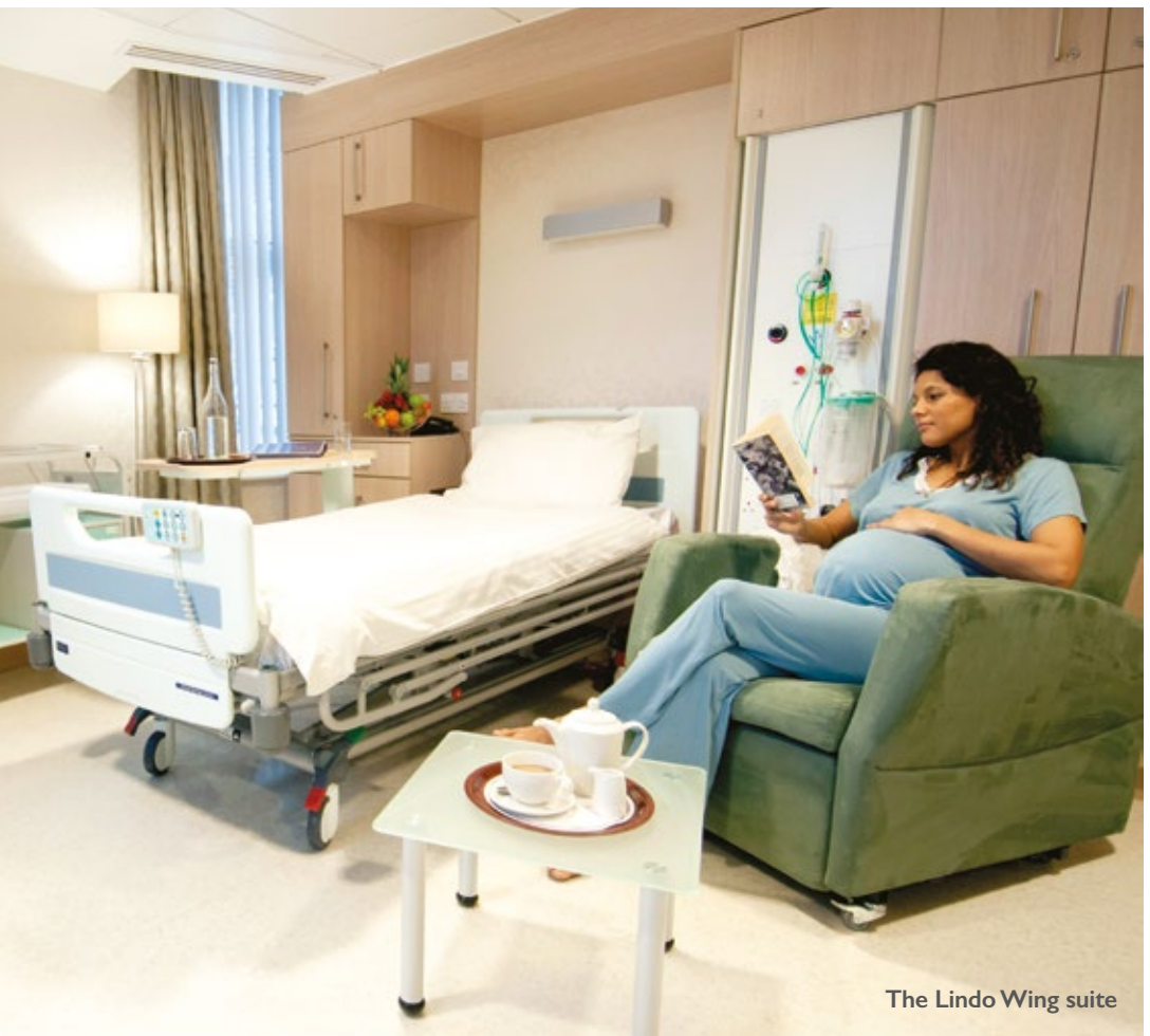
The Lindo Wing suite